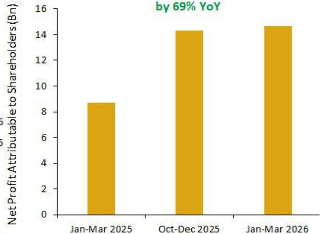
Cumulative Net Profit Attributable to Shareholders increased by 2% QoQ, increased by 69% YoY